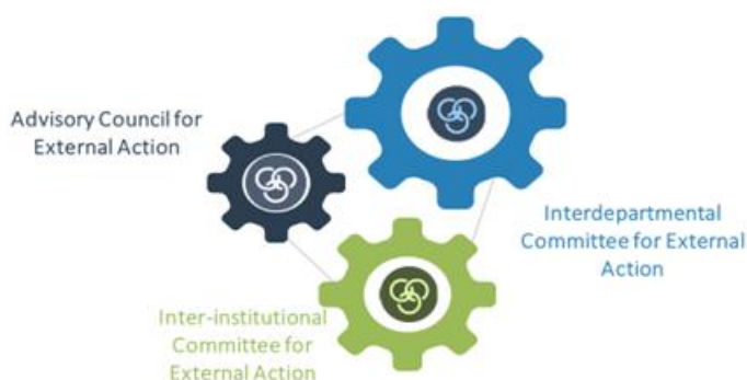
Illustration 3: Main pillars of the model of governance

The Interdepartmental Committee for External Action is in charge of coordinating and planning external action by the various departments of the Basque Government. It is convened and run by the General Secretariat for External Action. Its members are the General Secretary for External Action and high-ranking officers representing each Department of the Basque Government. The table below lists the functions of this committee.