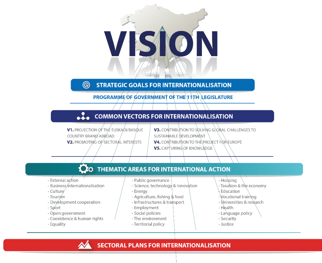
Illustration 1: Updated structure of the EBC 2020